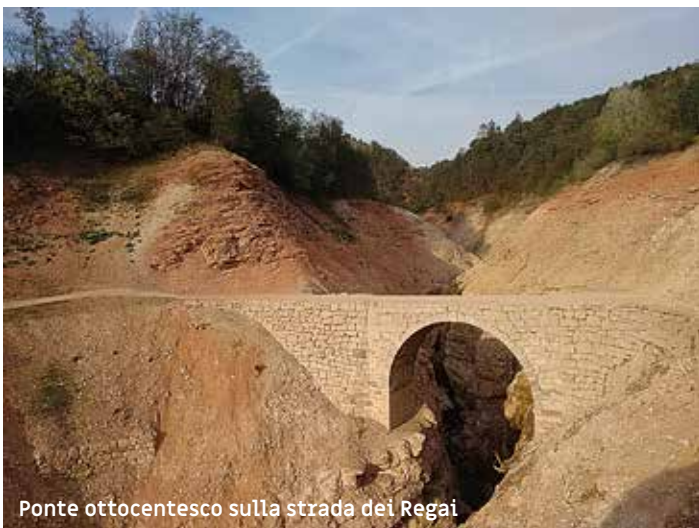
Ponte ottocentesco sulla strada del Regai

The capacity of the lake is 182 million m 3 ; it is 7 km long and its widest point is 1,5 km and it covers an area of 3,5 km 2 .